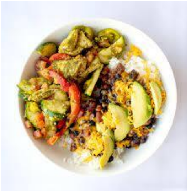
Crazy Bowls & Wraps "Fajita Bowl"