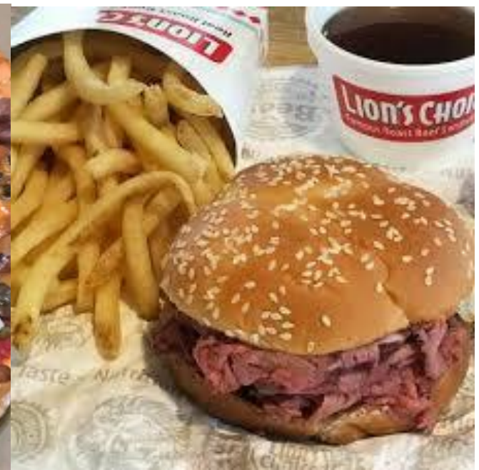
Lion's Choice Roast Beef Sandwich & Fries