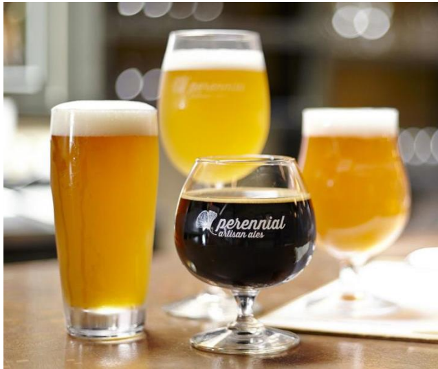
Beer at Perennial