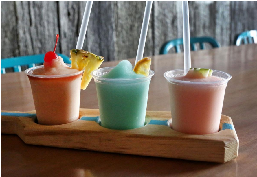
A "flight" at Narwhal's Crafted