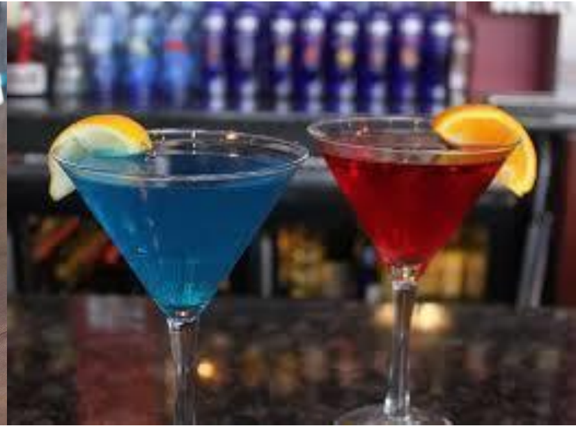
Martini's at Blue Sky Cafe