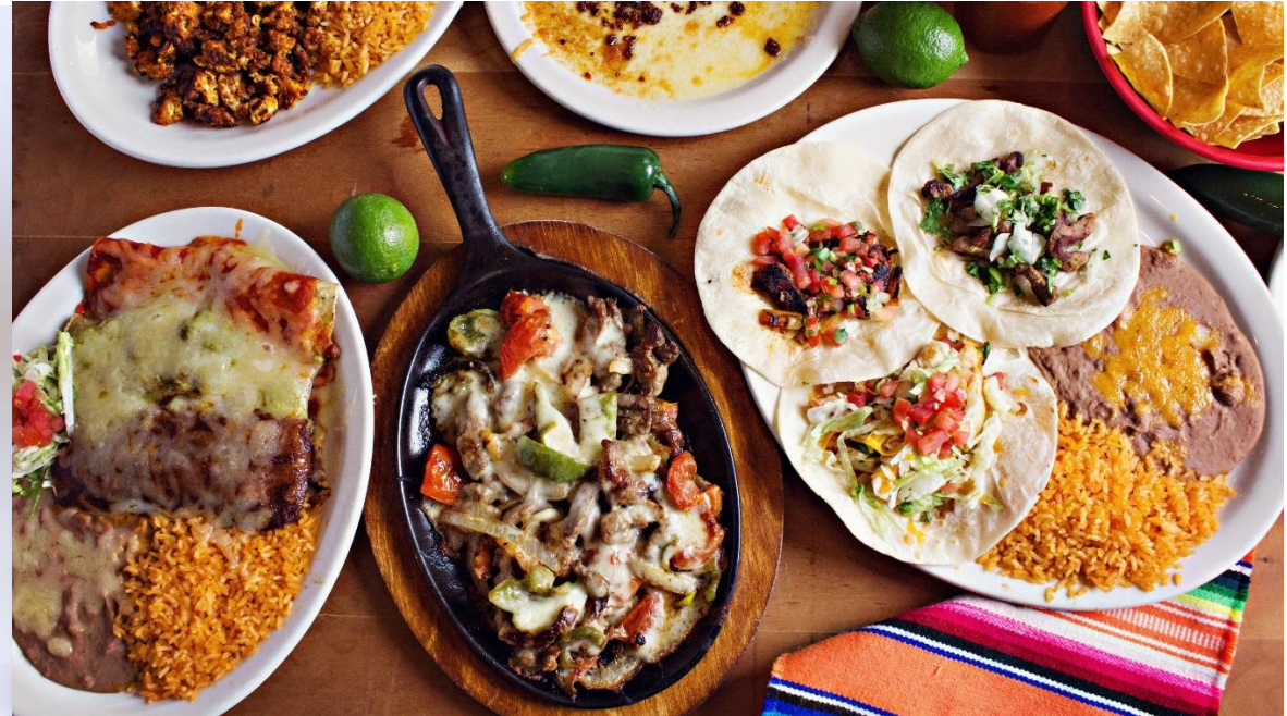
El Tio Pepe spread - so many good options